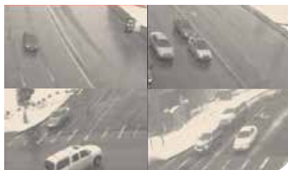
Quad view of four cameras for intersection overview